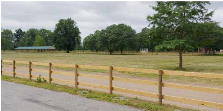
Avon Driving Park