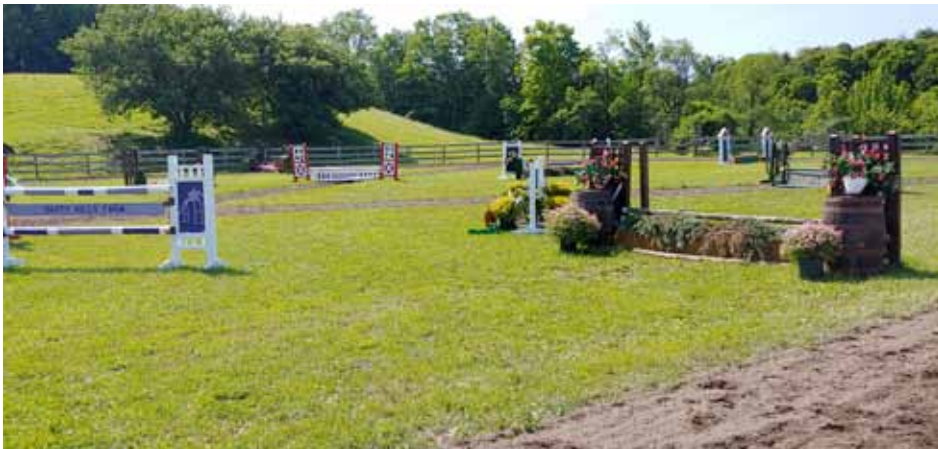
Genesee Valley Breeders Jump Course

Our Association welcomes back as a member Fair the Genesee Valley Breeders Association. Our Board of Directors voted to reinstate their membership in the NYSAAF at the Spring Board Meeting. The Breeders Association is an organization that is active in promoting the equine industry and its related activities. They will again be home at the Avon Driving Park in Avon, New York once the final upgrades are completed at the Driving Park. In the meantime they have been conducting their activities in the Western New York area.